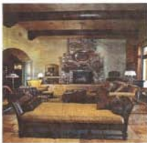
Faux-finished walls render an "aged" patina that complements the wood beams and stone fireplace in this room.

The challenge for interior designer Traci Shields, of Friedman and Shields Fine Interior Design in Scottsdale, was to put small-scale antiques in larger-scale rooms with higher ceilings, clerestory windows and a massive stone fireplace.