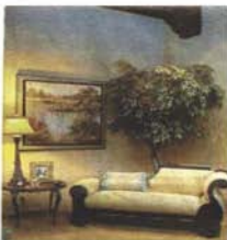
The new home holds plenty of space for cherished items such as furniture, furnishings and art collected over the years.